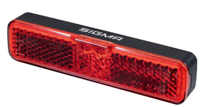
EOX ® RL RACK